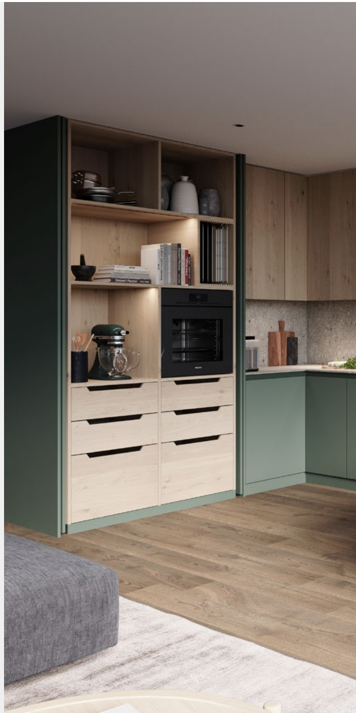
Open layouts awaken the desire for a smooth transition from the kitchen to the living area.

This is all based on technology that is just as invisible as a kitchen that is currently not in use.